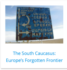
The South Caucasus: Europe's Forgotten Frontier