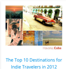
The Top 10 Destinations for Indie Travelers in 2012

Filed under: Drink , featured , Festivals