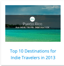
Top 10 Destinations for Indie Travelers in 2013